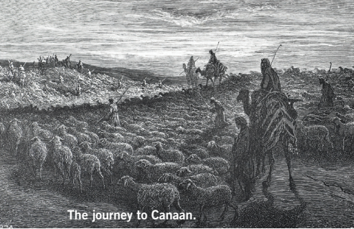
The journey to Canaan.